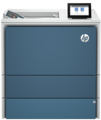
HP Color LaserJet Enterprise X654dn Printer

This printer is intended to work only with cartridges that have a new or reused HP chip, and it uses dynamic security measures to block cartridges using a non-HP chip. Periodic firmware updates will maintain the effectiveness of these measures and block cartridges that previously worked. A reused HP chip enables the use of reused, remanufactured, and refilled cartridges. More at: http://www.hp.com/learn/ds